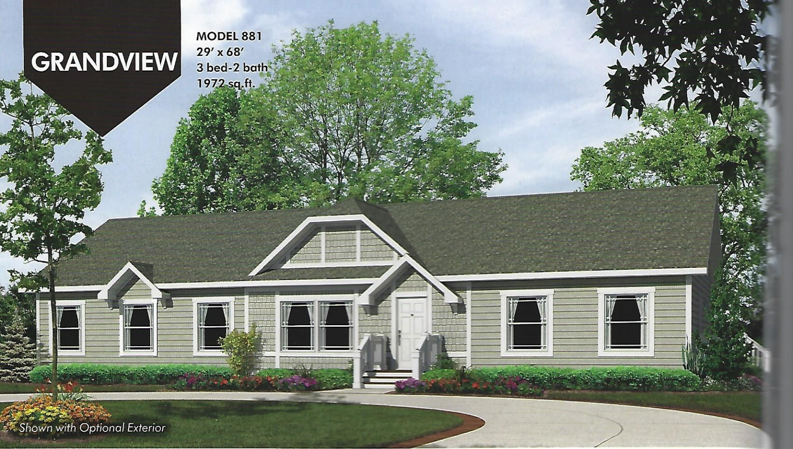
Shown with Optional Exterior

MODEL 881 29' x 68' 3 bed-2 bath 1972 sq. ft.