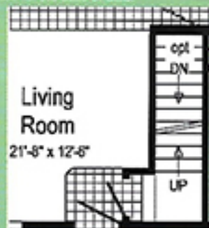
Opt Attic Stairs (omits g.c.)