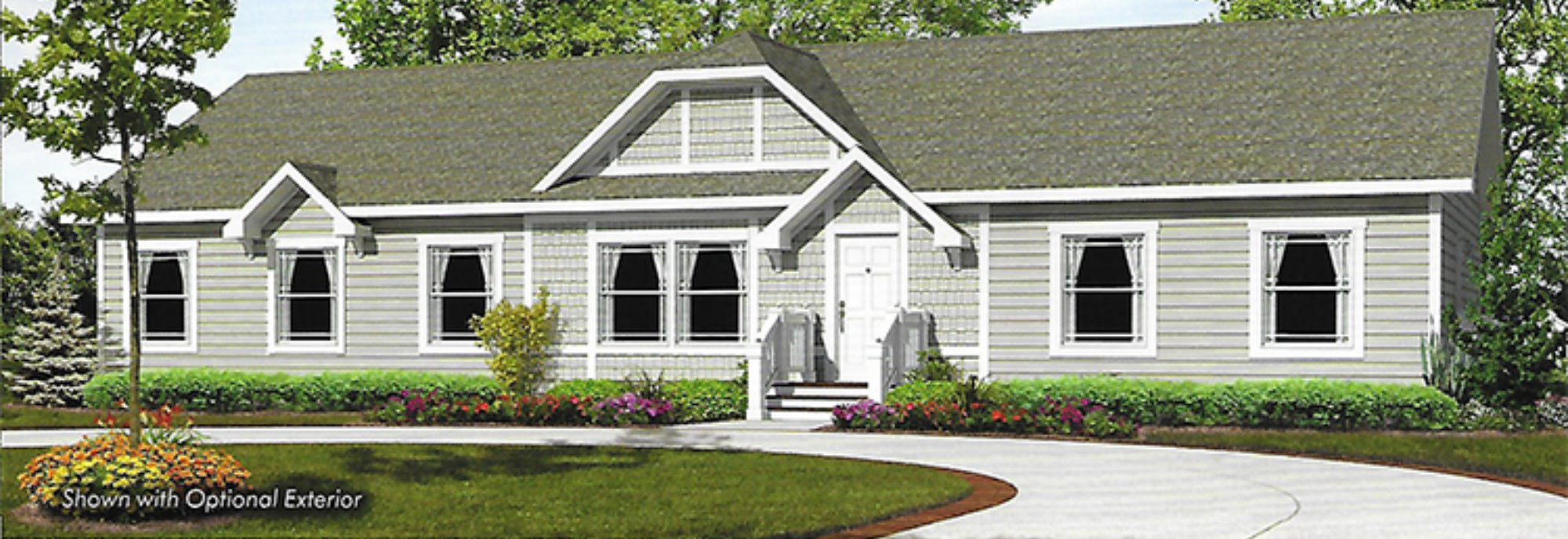
Shown with Optional Exterior

MODEL 881 29' x 68' 3 bed-2 bath 1972 sq.ft.